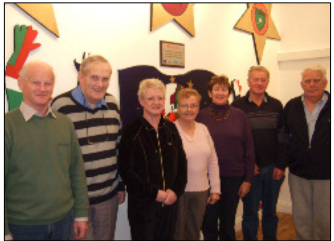
□ COMPUTERS for Over 55s at South West Wexford Community Development Project. Getting Started is a free programme for older people to help them gain confidence and basic skills in computers, internet and mobile phones.

"Puppetry reaches out a helpful hand for Social Inclusion": Making puppetry a part of the Level 3 FETAC Module, through the local street theatre company. The project takes