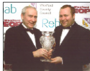
☐ Awards galore for the Buí Bolg Youth Group.

Buí Bolg would like to thank Wexford County Council, Wexford Borough Council and The Arts Council for their continued support of the Youth Group.